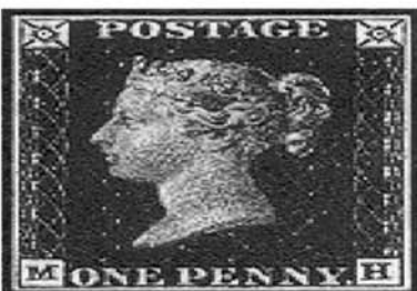
A postage stamp!!!