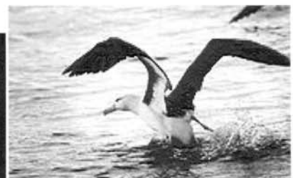
Black browed albatross!!!